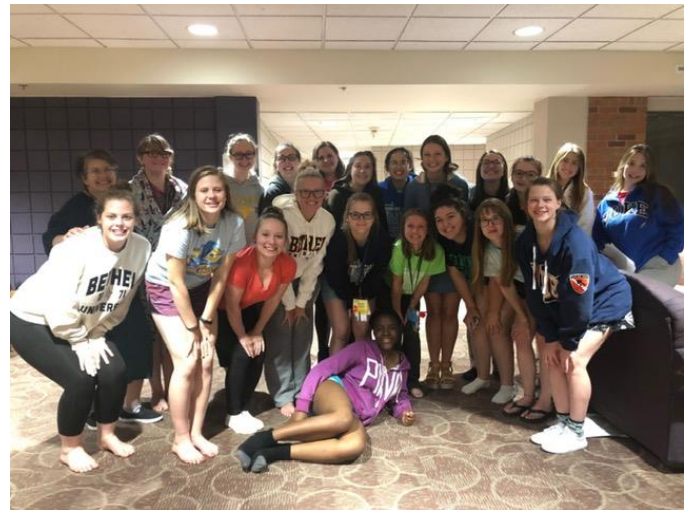
City of Cardinal

Hearing everyone's opinions and listening to the discussions"