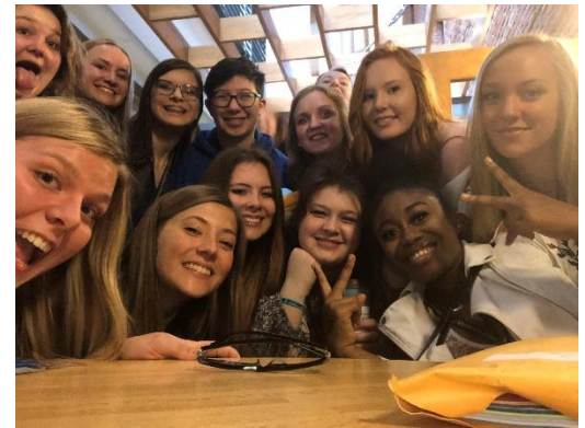
City of Eagle