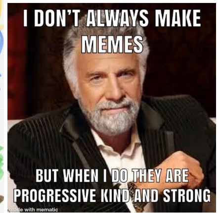
"Bob" Artist Anonymous